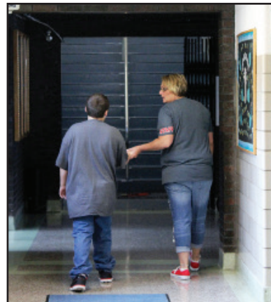
Vern Riffe School students returned to class Monday, Aug. 27, greeted by VRS staff as they got off their buses.