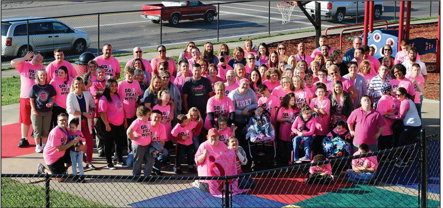
Students and staff at Scioto County Developmental Disabilities showed their support for Breast Cancer Awareness Month by putting on their pink and gathering on the playground for the annual Pink Out photo on Friday, Oct. 12. We support awareness and research!